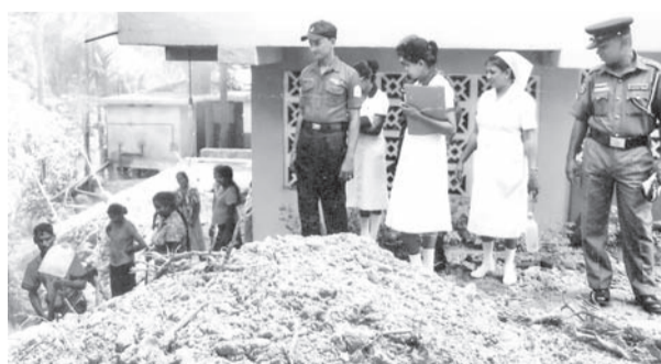
A dengue-prevention shramadana campaign organised by the office of the Medical Officer of Health, Ingiriya, the STF Training School, Katukurunda, the Navy Headquarters, Welisara and the Ingiriya police was held in Ingiriya recently. Here the residents clean an area on the advice of officials.