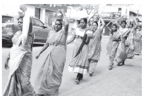
The Holy Palkudam procession (Palkudam Bawan) of the Arulmigu Sri Sivasubramaniam Swamy Devasthanam, Slave Island was held recently. Here devotees of the Saiva Munnetra Sangam in a procession from the Sri Sitti Vinayagar Kovil to the devasthanam.