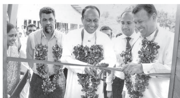
The Dalu Tea Centre, a centre to popularise Sri Lanka tea among tourists visiting the Sinharaja Forest was opened at the Lumbini Tea Factory premises, Pallegama recently. Here Plantation Industries Minister Mahinda Samarasinghe and Investment Promotion Minister Lakshman Yapa Abeywardana open the centre. Southern Provincial Cultural and Sports Minister Weerasumana Weerasinghe is also in the picture.