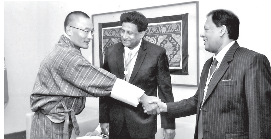
The 40th session of the United Nations Economic and Social Commission for Asia and the Pacific (ESCAP) was held in Bangkok, Thailand recently. Here Senior Minister of International Monetary Cooperation and Deputy Minister of Finance, Dr. Sarath Amunugama greets the Chair of the session and Prime Minister of Bhutan, Tshering Tobgay.