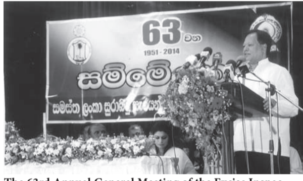
The 63rd Annual General Meeting of the Excise Inspector's Union was held at the Sri Lanka Foundation Institute recently. Here the chief guest, Minister of International Monetary Cooperation and Deputy Minister of Finance Dr. Sarath Amunugama addresses the gathering.