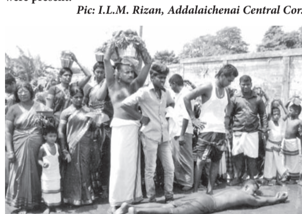
The Pal Kudam Bawani (Holy Milk Pots procession) of Sri Bathrakali Amman Kovil, Navakelanipura, Wellampitiya was held recently. Here a young devotee performs a Angaprethistai to fulfil a vow.