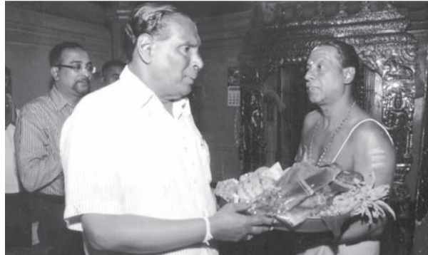
Minister of Public Administration and Home Affairs, W.D.J. Seneviratne worshipped at the Thirukoneswaram Temple, Trincomalee recently, while on a tour of the district under the SLP's Rata Rakina Nilpura Surakimu Mawbima program.