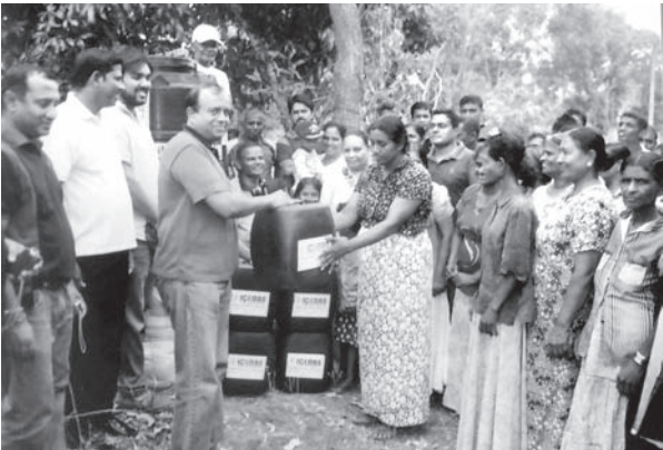
Iceman Group of Companies, Kandana donated a large number of water barrels and portable water tanks to the drought-affected people in the Polonnaruwa district recently.