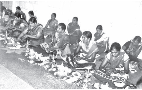
The Varalakshmi Thiruvilaku pooja ceremony was held at the Gnanabairavar, Devasthanam, Grandpass Colombo recently. Here an event is in progress.