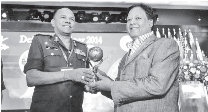
The fourth Defence Seminar of the Sri Lanka Army was held at the Hotel Galadari recently. Here the Army Commander Lt. Gen. Daya Ratnayake presents a memento to the chief guest on the third day, Senior Minister and Deputy Minister of Finance Dr. Sarath Amunugama.