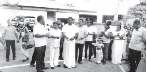
The newly carpeted Kalutara-Kandewatta Road built at a cost of Rs. 196 lakhs was opened recently by the Project Minister of Highways, Ports and Shipping, Rohitha Abeygunawardana.