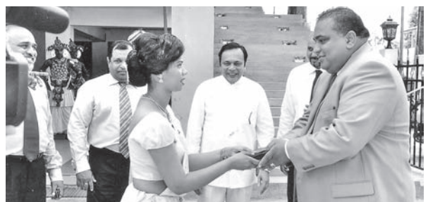
The prize-giving of the Dehiwala Vocational Training Centre, managed by the Dehiwala-Galkissa Municipal Council and the National Youth Services Council was held recently. Here the chief guest, Mayor and SLFP Organiser, Dehiwala Dhanesiri Amaratunga is being welcomed by a trainee. The guest of honour Deputy Minister of Education, Mohanlal Gero is also in the picture.