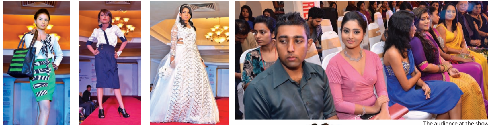
The audience at the show