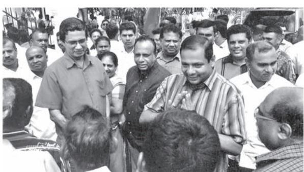
Minister of Civil Aviation Piyankara Jayarathna, Minister of Botanical Gardens and Leisure, Jayarathna Herath, Deputy Minister of Health Lalith Dissanayake being welcomed by the public during a conference of SLPF delegates at the Anamaduwa electorate.