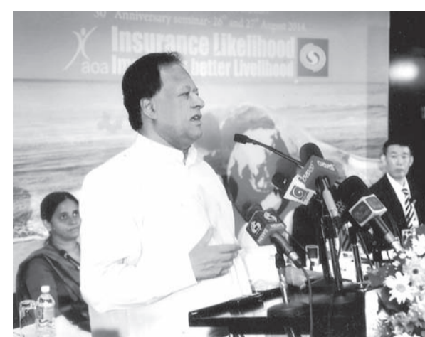
A seminar to mark the thirtieth anniversary of the Asia-Oceanic Association was held at the Colombo Anamman Grand Hotel recently. Here the chief guest, Senior Minister of International Monetary Cooperation and Deputy Minister of Finance and Planning, Dr. Sarath Amunugama addresses the gathering.