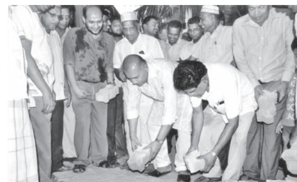
The second stage construction of the Addalaichenai-Konawattia ferry was inaugurated by Local Government and Provincial Councils Minister A.L.M. Athaullah recently. Eastern Province Road Development Minister M.S. Udumalebbe, Education Minister, Wimalaweera Dissanayaka and Eastern Provincial Councillor, Ariff Samsudeen were also present.