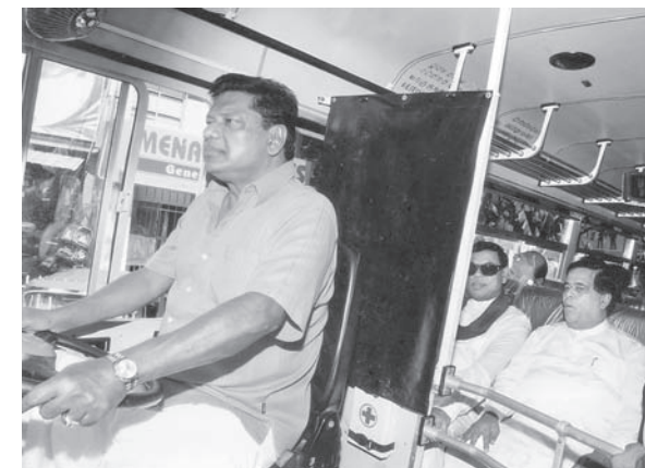
Transport Minister Kumara Welgama allocated new buses to the Badulla CTB Depot recently. Here the Minister inaugurates a new bus service. Ministers Basil Rajapaksa and Nimala Sripal de Silva are also in the picture.