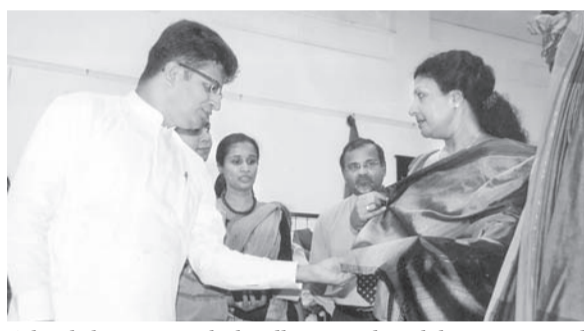
Ath Pehakam - 2014 , the handloom textiles exhibition organised by the WPC Industrial Department was held at the Colombo Art Gallery recently. Deputy Minister of Water Supply and Drainage, Nirupama Rajapaksa was the chief guest. WPC Industrial, Art and Cultural Minister Udaya Gammanpila, acting Chief Secretary, Western Province, Daya Senarath are also in the picture.