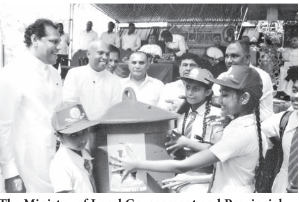
The Ministry of Local Government and Provincial Councils will produce compost manure from waste materials in State schools in the Kurunegala district. Here waste - collection bins being distributed among schools in Bingiriya recently. Minister of Local Government and Provincial Councils A.L.M. Athaulla, Deputy Minister Indika Bandaranayake and NWP Chief Minister Dayasiri Jayasekara look on.