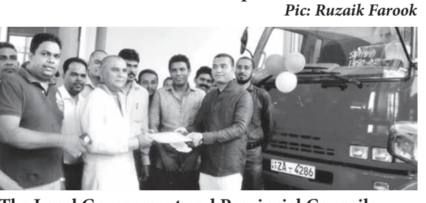
The Local Government and Provincial Councils Ministry allocated a fire and rescue vehicle worth Rs. 80 million to the Akkaraipattu Municipal Council recently. Here Local Government and Provincial Councils Minister, A.L.M. Athaullah presents the keys to Akkaraipattu Mayor, A. Ahamed Zackie at a ceremony. Deputy Mayor, M.M.M. Rizam, Councillors and the Accountant, K. Rizvi Yahzar were also