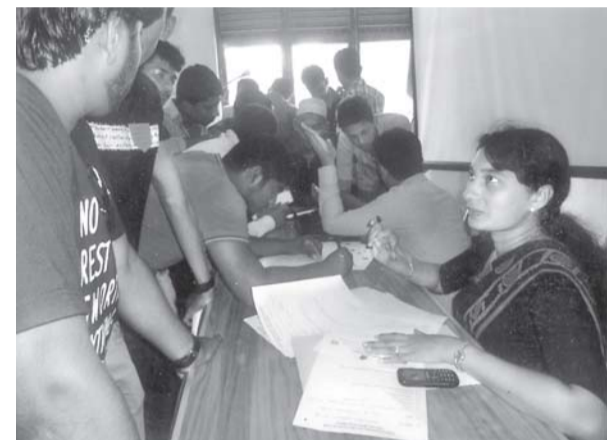
The Puttalam Divisional Secretariat and the North Western Province Human Resource Development Authority, organised a seminar on Vocational Training at the Puttalam AGA's office Here a section of the participants.

It is organised by the Krishnamurti Centre, Sri Lanka Inc.