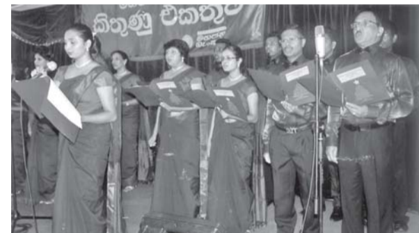
The 36th annual Christmas carols organised by the Executive Committee of the People's Bank Christian Guild was held at the People's Bank Training Centre auditorium, D.R. Wijewardene Mawatha, Colombo.