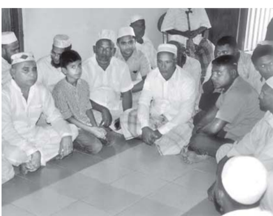
Local Government and Provincial Councils Minister, A.L.M. Athaullah paid a visit to the Kathiriya Jummah Mosque, Akkaraipattu recently, where he discussed the shortcomings of the mosque with the members of the Board of Trustees.