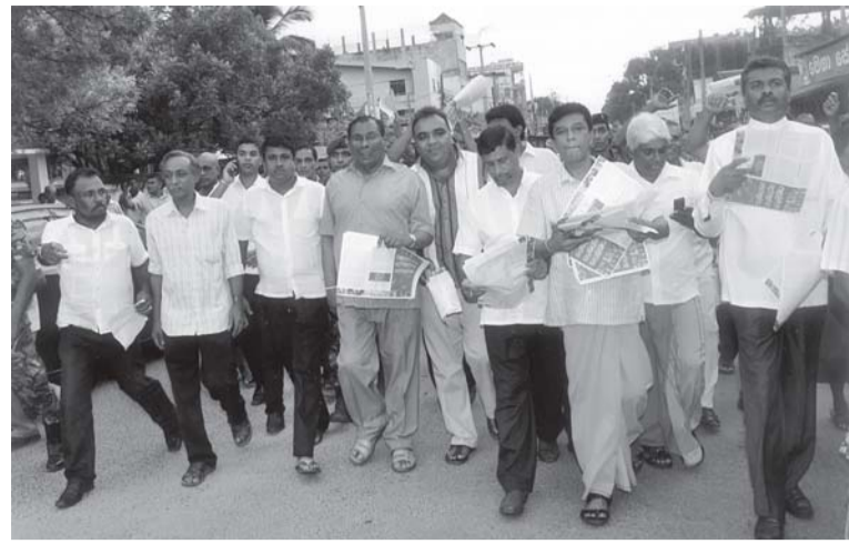
Public Administration and Home Affairs Minister and Ratnapura district parliamentarian, W.D.J. Seneviratne leads a propaganda Walk, displaying the election manifesto of President Mahinda Rajapaksa. Here the Minister with the UPFA supporters at the Walk.