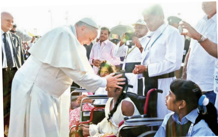
Pope Francis prays for a differently-abled girl at the Galle Face Green.