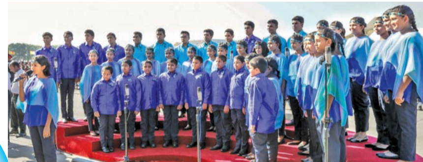
Choirs from various schools sing the welcome song for Pope Francis.