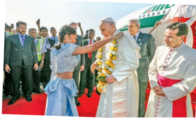
Pope Francis being garlanded on his arrival