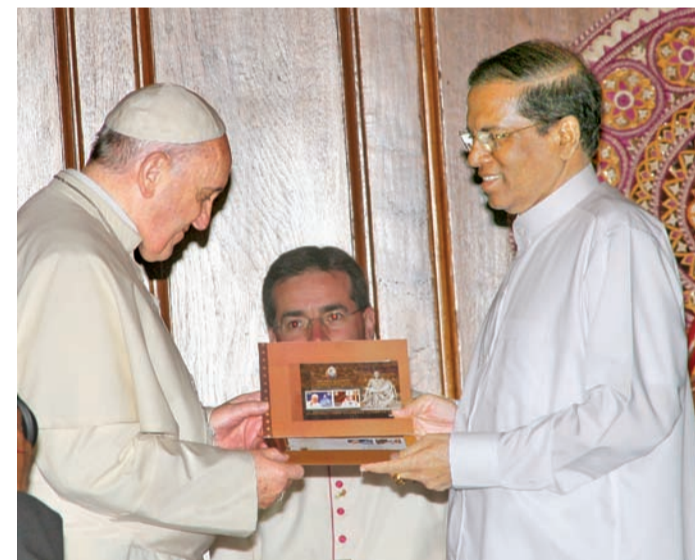
President Maithripala Sirisena presents Pope Francis a photo album covering his visit to Sri Lanka.