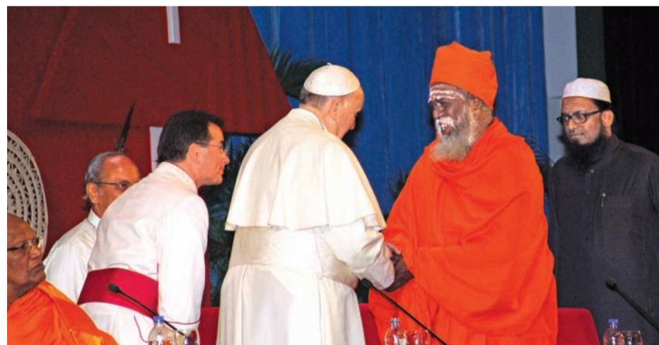
The Pontiff greets a Hindu kurukkal