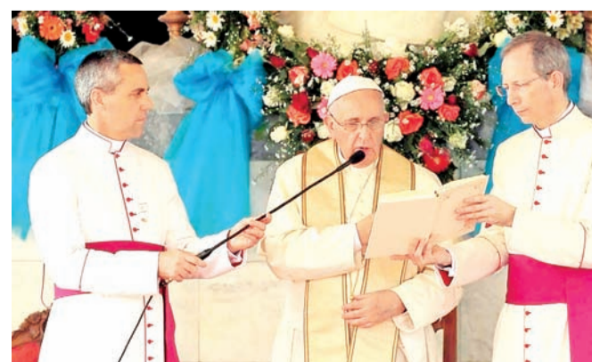
Pope Francis at the Madhu Shrine in Mannar.