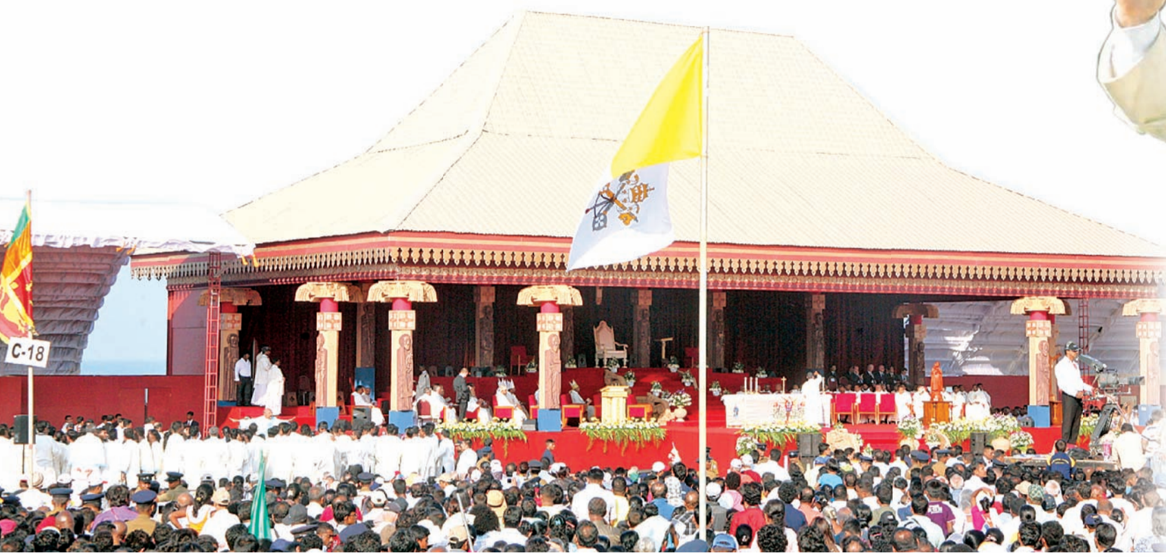
A large number of devotees gather at the Galle Face Green for the canonisation of Joseph Vaz.