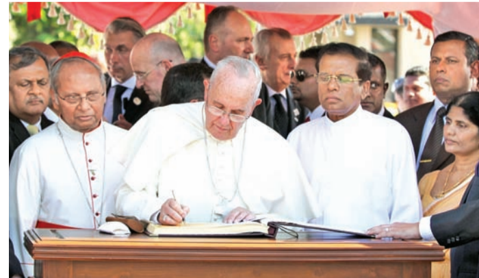
Pope Francis signs the Visitors Book on arrival at the airport.