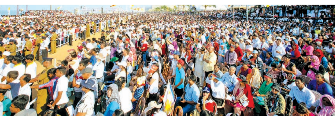
Crowds thronged the Galle Face Green on Wednesday.

Pope Francis the 'People's Pope' was on a three-day pastoral visit to Sri Lanka primarily for the canonisation of the country's first Saint Joseph Vaz, a revered missionary from Goa, India. Catholics and devotees of other faiths flocked in large numbers along the Negombo Road and the Galle Face Green to have a glimpse of the Pontiff who is hailed for his simplicity and love for the poor.