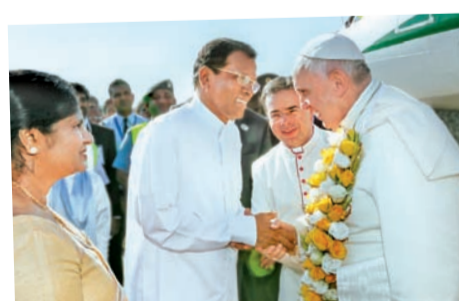
President Maithripala Sirisena and First Lady Jayanthi Sirisena welcome the Holy Father.