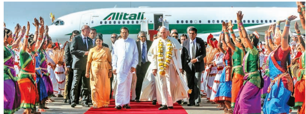
Pope Francis being accorded a red carpet welcome at the Bandaranaike International Airport.