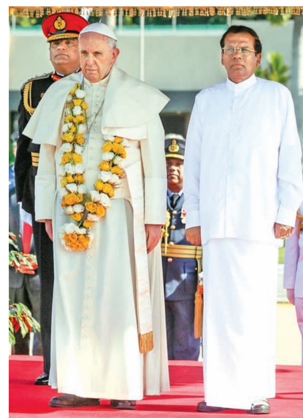
Pope Francis and President Maithripala Sirisena stand to attention for the national anthem.