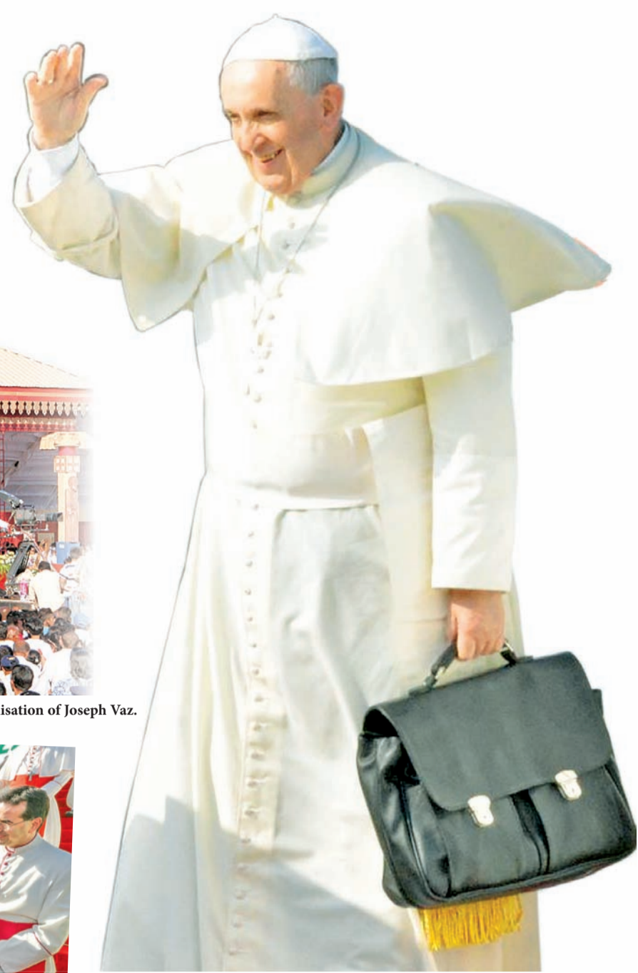
Pope Francis waves at the milling crowds