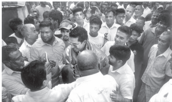
Deputy Minister of Justice and Labour, Sujeewa Senasinghe received a warm welcome from the residents of Malegawatte Apple Garden.