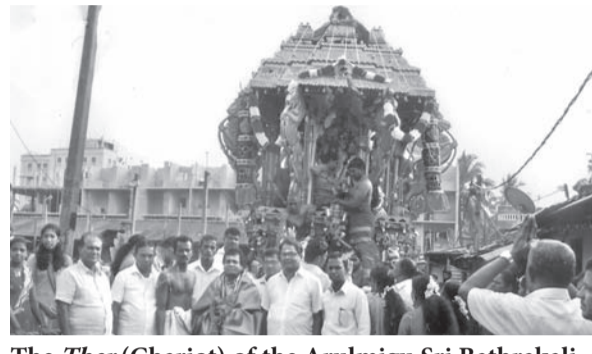
The Theer (Chariot) of the Arulmigu Sri Bathrakali Amman Kovil, Paradise Place, Colombo 12 was held recently. Here invitees and the kovil's Board of Trustees in front of the chariot before the commencement of the procession.