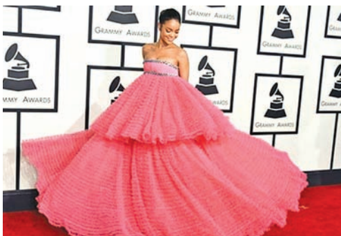
Rihanna in Giambattista Valli