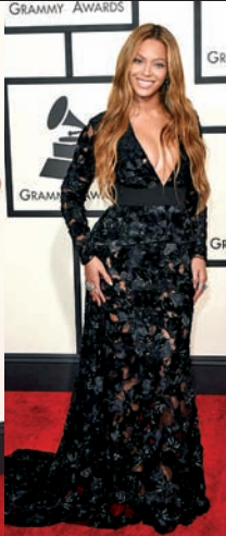
Beyonce in Preenza Schouler

Some of the biggest stars in the music world were present at the Grammy Awards 2015 in Los Angeles, the most prestigious night in the pop calendar.