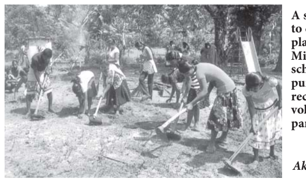
A shramadana to clean the playground of Milindu preschool, Mandalapura was held recently. Over 40 volunteers took part.