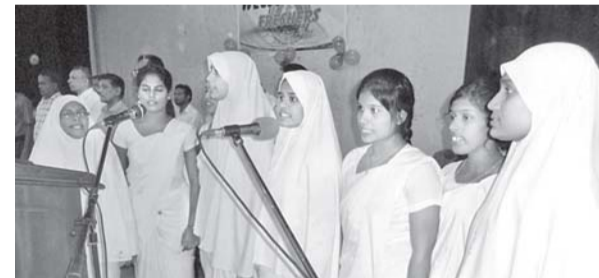
One hundred and twenty teacher trainees were selected to the Addalaichenai National College of Education for the Academic year 2014/16. Here the senior trainees sing the welcome song.