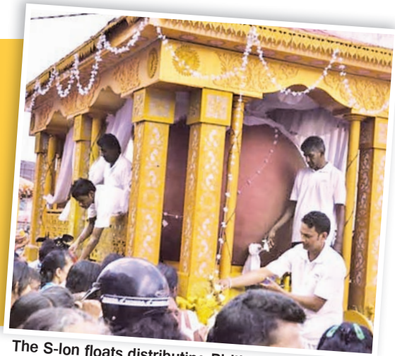
The S-lon floats distributing Pirith water, Pirith nool and Gatha booklets attracted a large number of devotees along the Perahera route