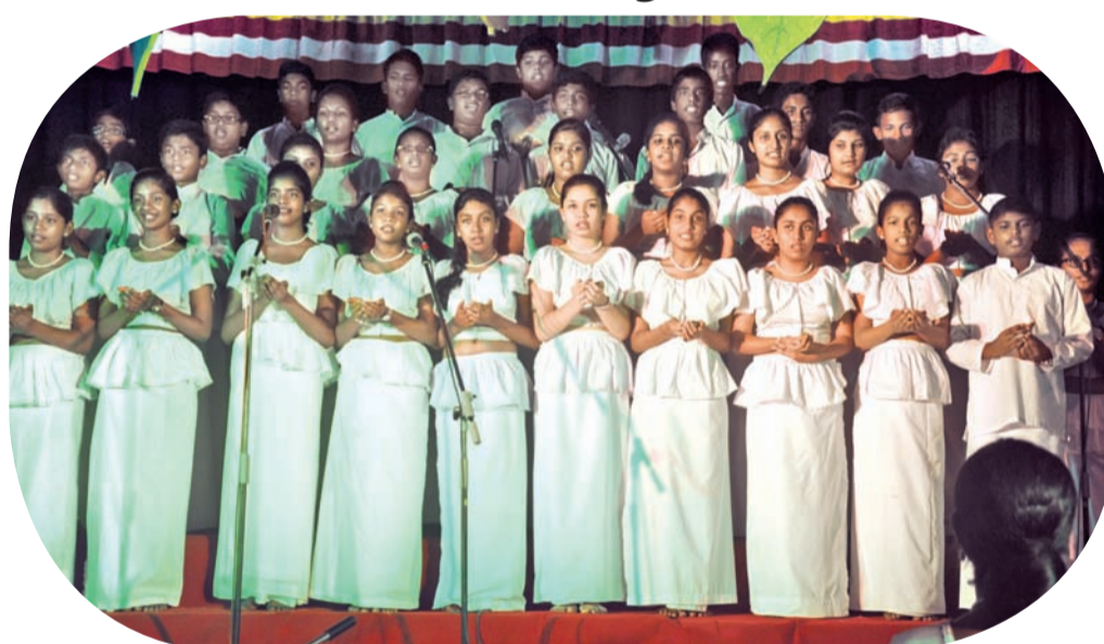
Belvoir College International students participated in a Bhakthi Gee recital at St. Paul's Girls School, Milagiriya recently.