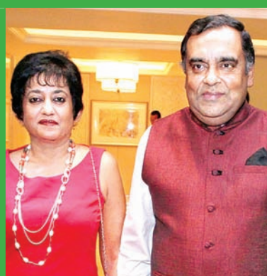
Y.K. Sinha High Commissioner for India and Girija