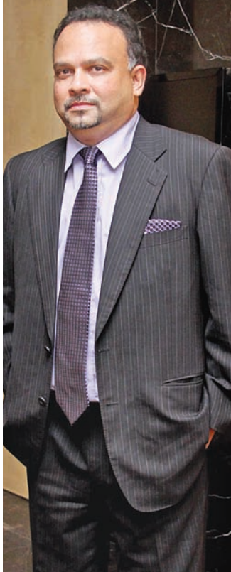
Minister Navin Dissanayake