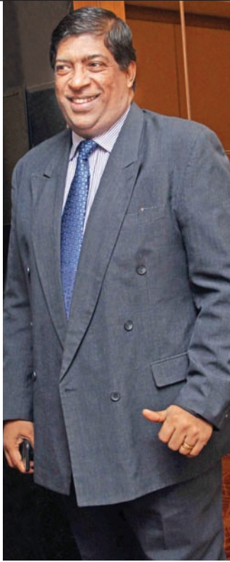
Minister Ravi Karunanayake