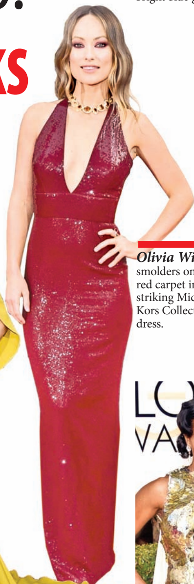
Olivia Wilde smolders on the red carpet in a striking Michael Kors Collection dress.