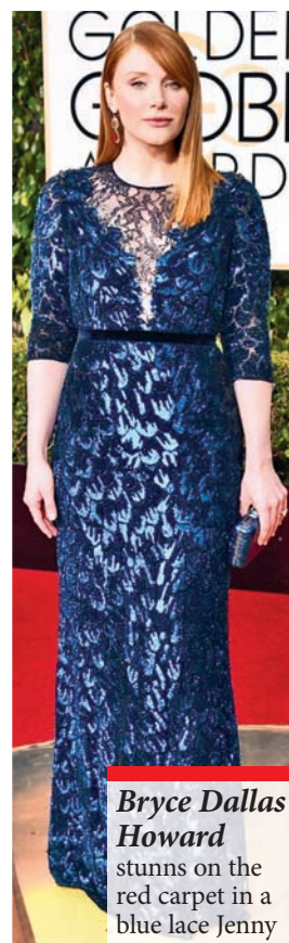
Bryce Dallas Howard stuns on the red carpet in a blue lace Jenny Packham gown