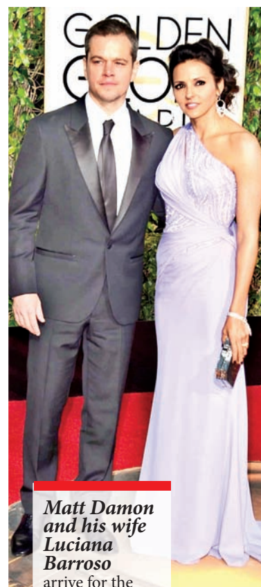
Matt Damon and his wife Luciana Barroso arrive for the Golden Globe Awards