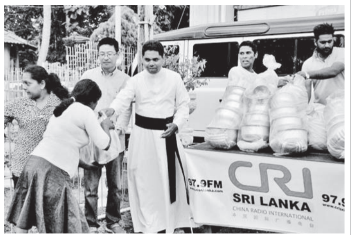
The China Harbour Hambantota Port Development Project Co. and the China Harbour Southern Expressway Section-4 Extension Project Co. with the China Radio International Sri Lanka FM 97.9 distributed essential household items to 300 families affected by the recent floods at St. Mary's Church, Peliyagoda recently.