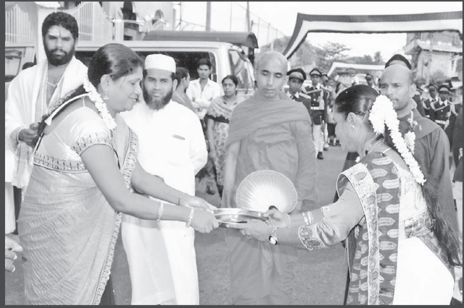
The Annual Feast of St. Anthony's Church, Navagampura, Grandpass, Colombo 14 took place under the patronage of Inter-Religious Priests this year. Here the invitees are received by the Trustees Board members on arrival as per religious tradition.