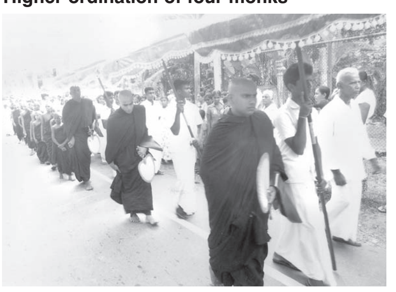
The four monks who received higher ordination at the Ganewatte Purana Raja Maha Viharaya, are taken in a colourful procession parading the streets of Nugagoda, Waskaduwa and Delduwa.