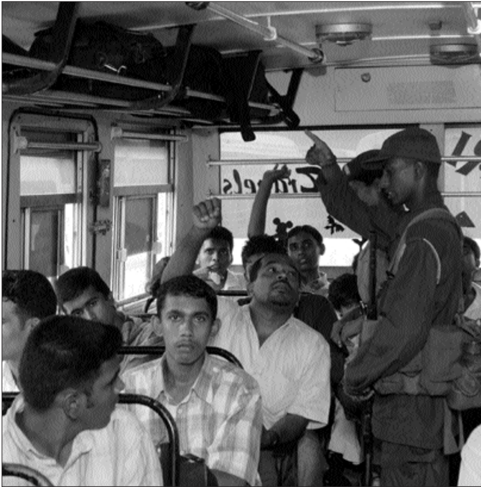
National security takes top priority as security personnel check the baggage to prevent possible terrorist acts in the city.