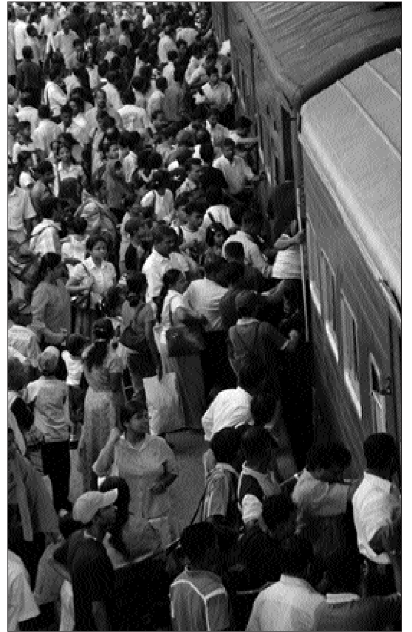
Workers in the city get onboard at the Fort Railway station to reach their destinations.