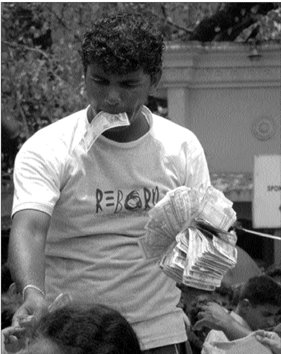
A pavement hawker woos potential customers