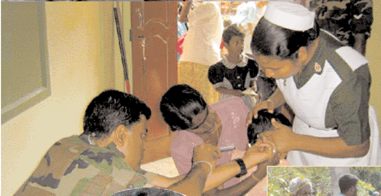
Successful operation in Sampur