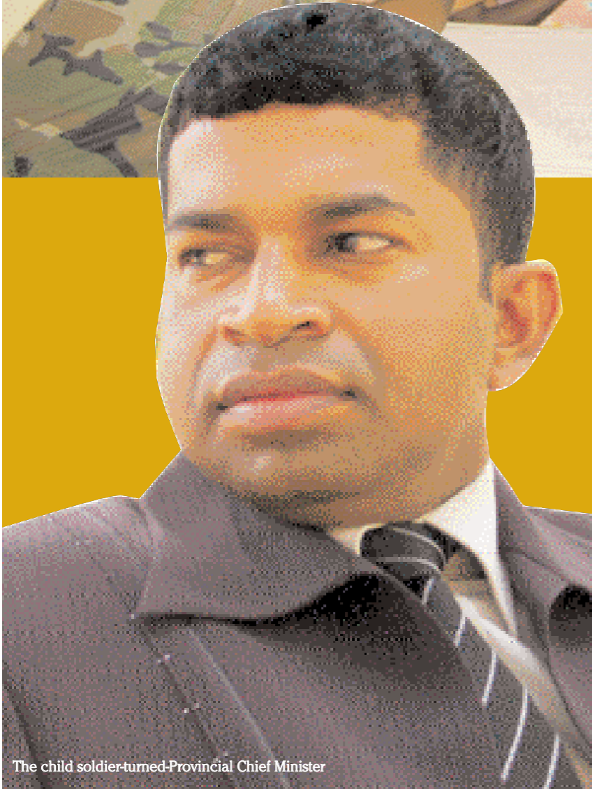
The child soldier-turned-Provincial Chief Minister