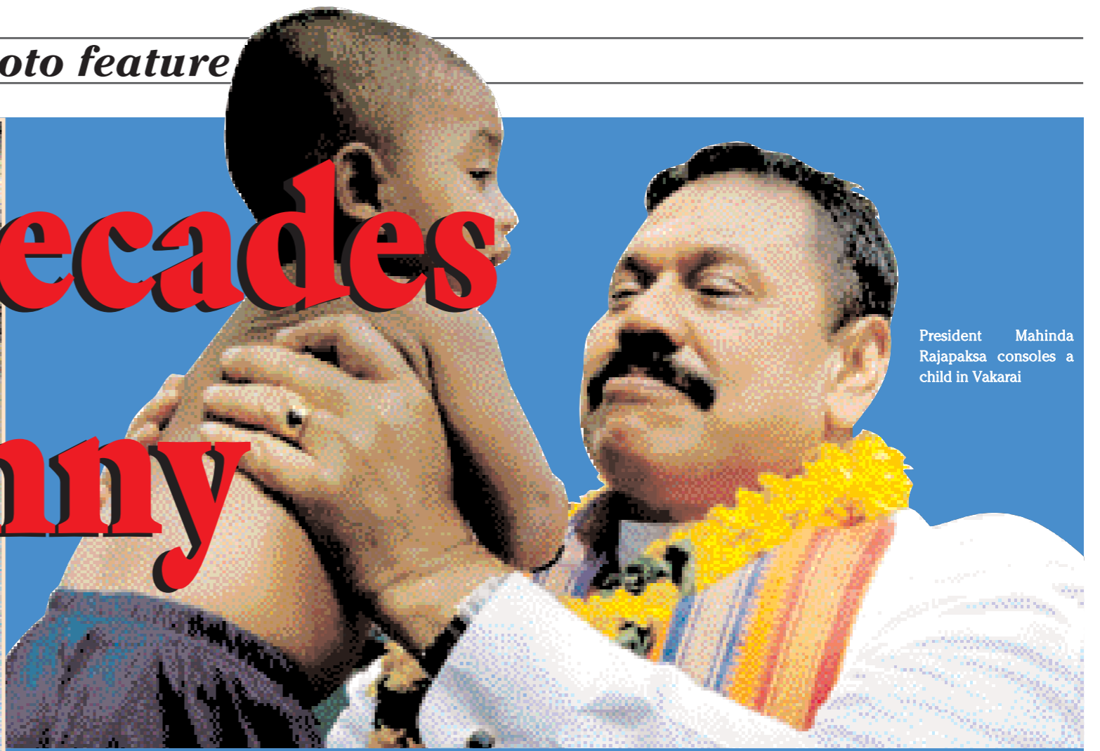
President Mahinda Rajapaksa consoles a child in Vakarai