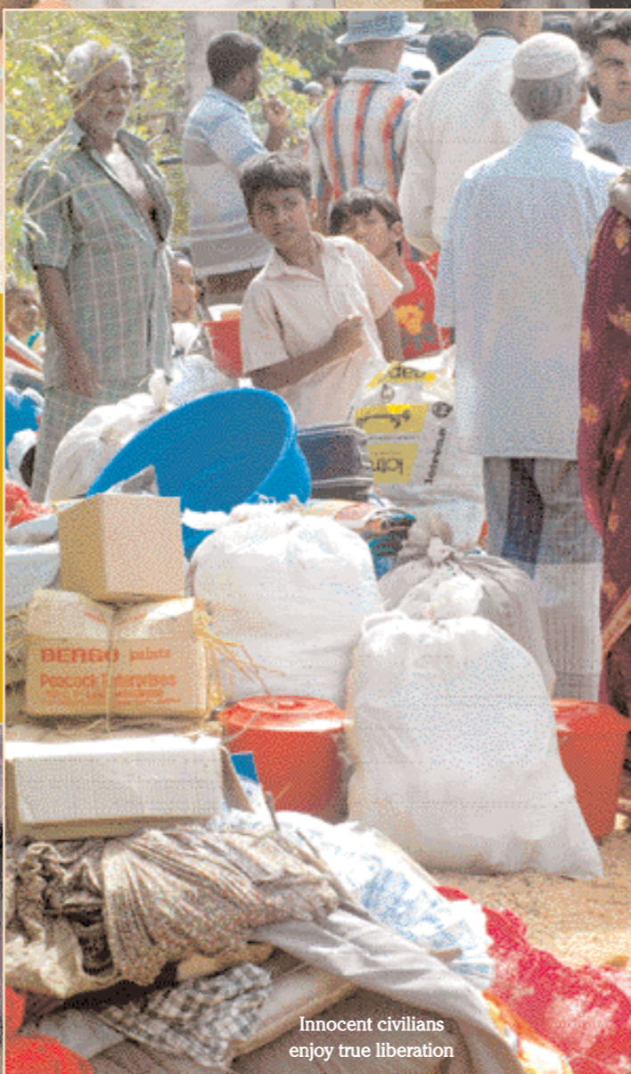
Innocent civilians enjoy true liberation