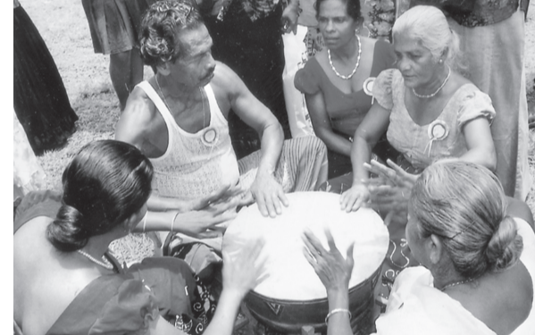
Traditional Rabana beating was one of the highlights at the Eheliyagoda Yovun Bak Maha Ulela at the public grounds, Eheliyagoda.