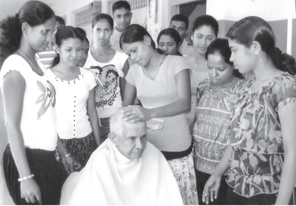
The Sri Lanka Graduates' Society, Horana recently visited the inmates of the Horana Elders' Home and gave them a shave, bath and a hair cut. New clothes and toiletries were also presented before the tea party.