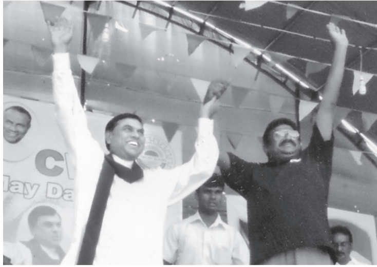
The May Day rally of the Ceylon Workers' Congress was held in Ginigathena Town. Here Economic Development Minister Basil Rajapaksa and Livestock and Rural Development Minister Arumugam Thondaman greet the cheering crowd.