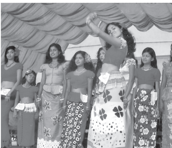
A "Yovun Avurudu Kumari" contestant displays her dancing skills at the New Year celebrations held on a grand scale at the public grounds, Eheliyagoda.