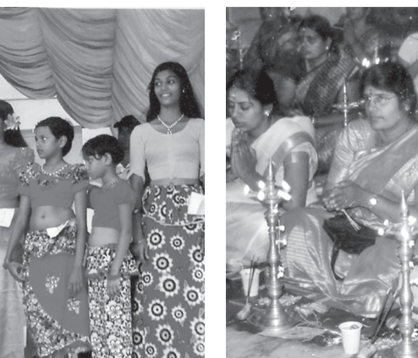
The Thiruvilakku pooja was held in all Hindu kovils and societies islandwide on Vesak Full Moon Poya Day. Here a similar ceremony is being held at the Sri Venkateswarar Maha Vishnu kovil, Modera, Colombo 15.