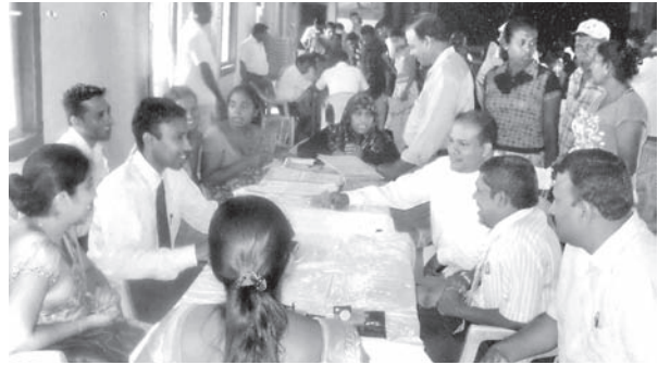
Residents of Puttalam attended the mobile service organised by the Provincial Ministry of Road Development, Electricity, Housing and Fisheries and the Puttalam Urban Council at the Puttalam Town Hall recently