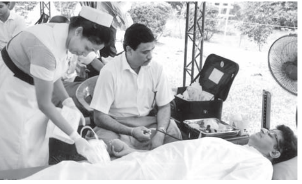
A blood donation campaign was organised by the Samadhi Padanama to mark the 42nd birthday of Western Provincial Council Minister Udaya Gammanpila. Here the Minister donates blood.