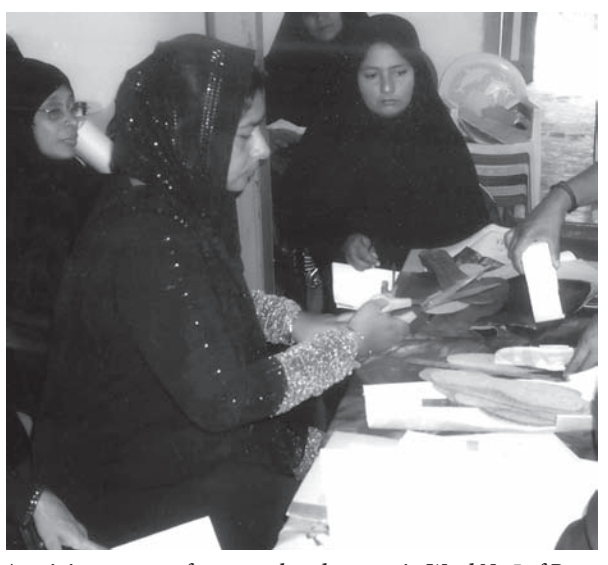
A training program for unemployed women in Ward No.5 of Puttalam Town, was conducted by the Ministry of Economic Development recently. Here the trainees turn out footwear.