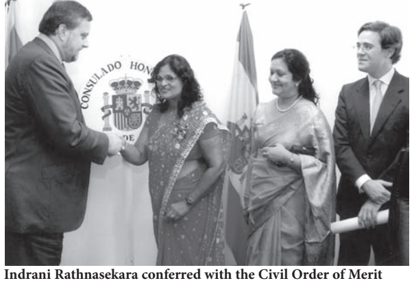
by the King of Spain Juan Carlos to promote bilateral relations between Sri Lanka and Spain. Here the Spanish Ambassador in