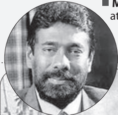
Former Minister Mahinda Wijesekera

■ March 11, 1988: A group of armed terrorists attacked private bus 22 Sri 2128 at Suhadagama with small arms and grenades, killing 19 passengers and injuring nine others in Horowpothana.