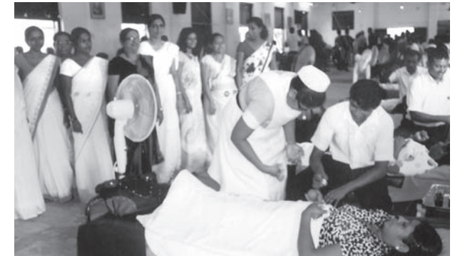
A blood-donation program organised by the Old Girls' Association of Sujatha Balika Vidyalaya, Matara was held at the College premises on May Day.