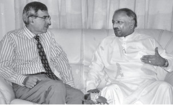
The High Commissioner of Pakistan Maj. Gen. Qasim Qureshi paid a courtesy call on Water Supply and Drainage Minister Dinesh Gunawardena at the Ministry at Pelawatta, Battaramulla recently.