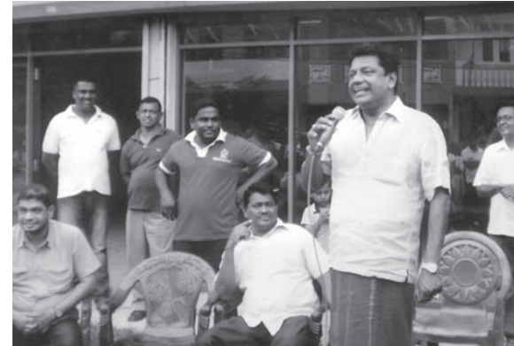
A new bus service from the Kalutara CTB depot to Panadura via Uggalboda, Panapitiya, Nugegoda and Pothupitiya Middle Road, was launched by Transport Minister Kumara Welgama recently. Here the Minister addresses the gathering.