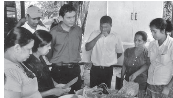
The Bulugahapitiya 'Vidatha' Centre, Eheliyagoda held a one-day workshop on 'Vegetable-Fruit dehydration process' for housewives in Wiyalagoda recently.