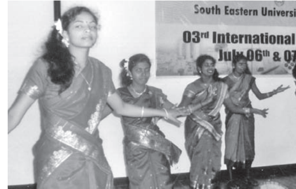
The cultural show on the first day of the third International Symposium of the South Eastern University of Sri Lanka at the auditorium of the Faculty of Islamic Studies and Arabic Language at the Oluvil Campus was highlights of the program. Here an event in progress.