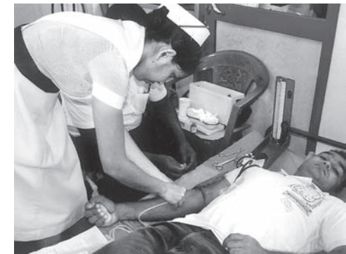
The staff of Eheliyagoda Post Office conducted a blood donation campaign to mark the 139th World Postal Day, during which 139 pints of blood were donated to the Blood Bank, Ratnapura.