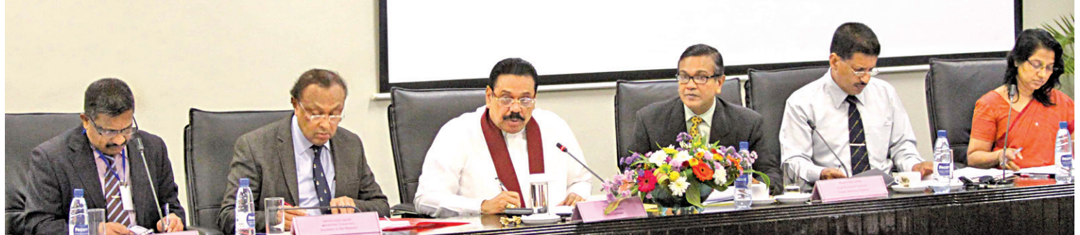
President Rajapaksa in parliament.