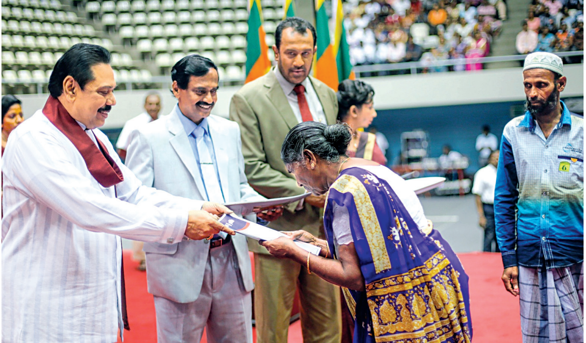
President Mahinda Rajapaksa presents a title deed to a recipient at the national festival of the Ranbima deed presentation.