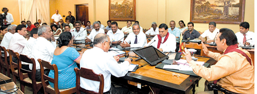
The President instructs Health Ministry officials to solve the problems of health sector trade unions.