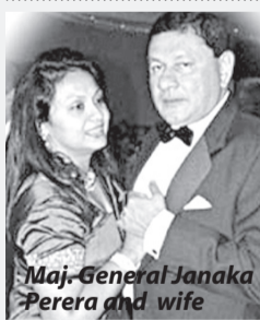
Maj. General Janaka Perera and wife

■ Oct. 6, 1987: LTTE cadres shot dead 27 Sinhalese villagers at Sagarapura in Kuchchaveli, Trincomalee.