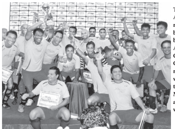
The Past Prefects' Association of Zahira College, Colombo organised a football match between All Stars and the Cricket Stars at the College Grounds recently. Here the winning team captain of Cricket Stars, Mahela Jayawardena and team members with the trophy.