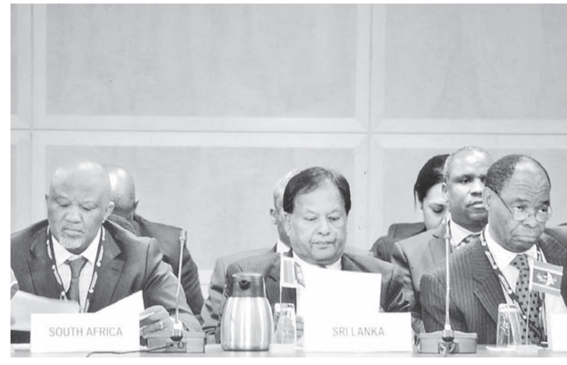
Senior Minister for International Monetary Co-operation and Deputy Minister of Finance and Planning, Dr. Sarath Amunugama addresses the delegates of the G24 during the IMF/World Bank Meeting in Washington, USA recently. The minister is flanked by representatives of South Africa and Swaziland.