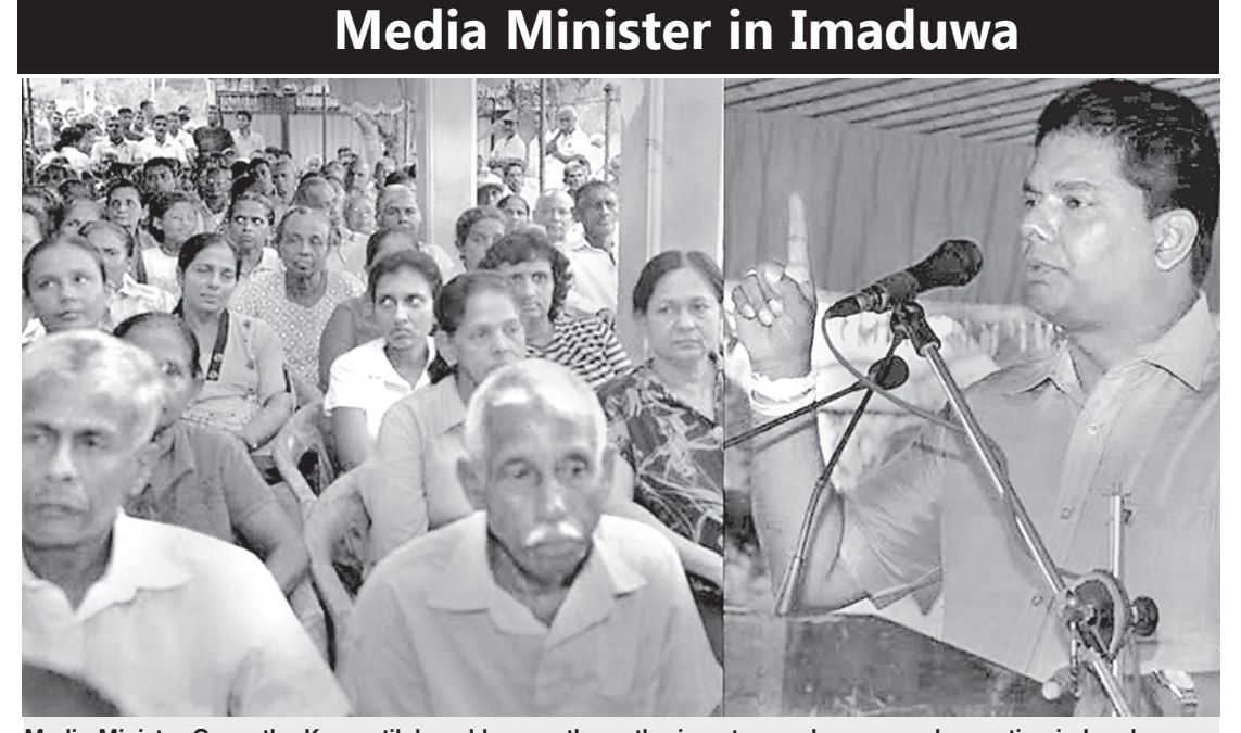
Media Minister Gayantha Karunatilake addresses the gathering at a rural propaganda meeting in Imaduwa