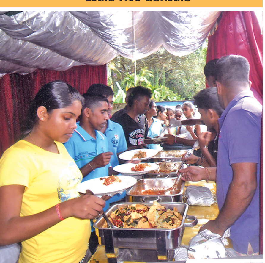
The Esala rice dansala organised by the Kalubowitiyana Taruna Kela was held for the fourth consecutive year at Kalubowitiyana on Esala Poya day.