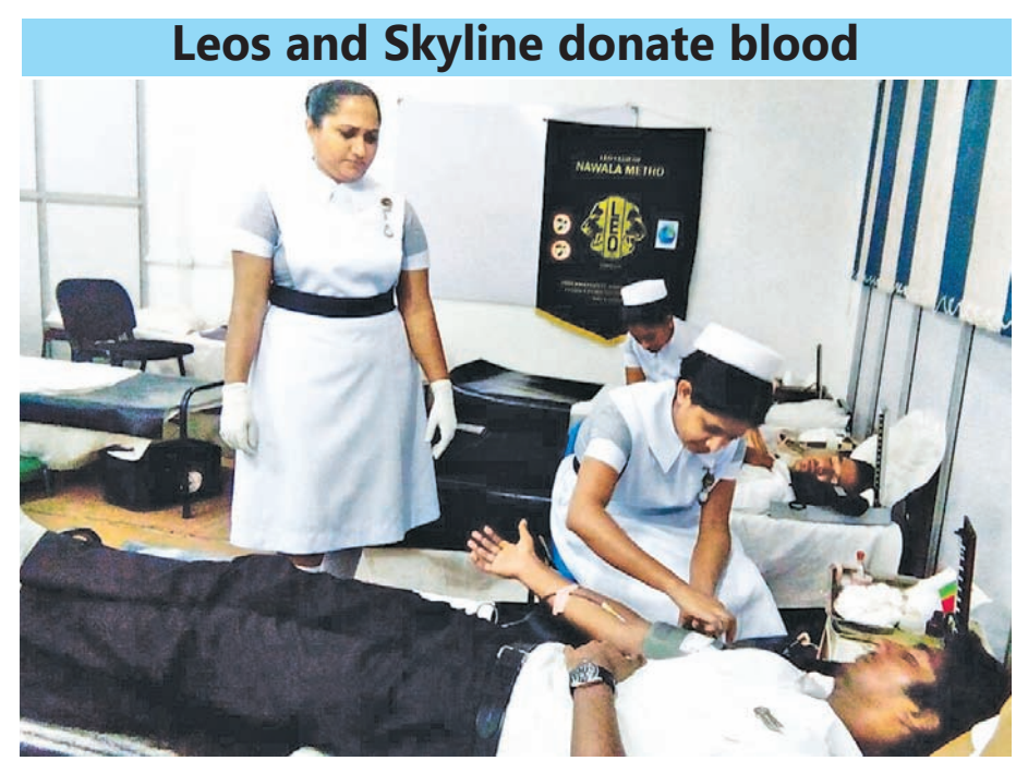
A blood donation campaign organised by the Leo Club of Nawala Metro and the Skyline Aviation was held recently at the Skyline Aviation School, Ratmalana. The blood was donated to the Cancer Hospital.